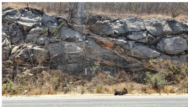
Figure 1. Target slope of the study.

The slope under study (see Figure 1) is located in the municipality of Boa Viagem, in the state of Ceará. The road cut is situated on the BR-020, a highway with a high traffic flow and which represents an area of geological risk due to the possible occurrence of mass movements in the rocks. Access to this area is possible from Fortaleza through the BR-020, which covers a distance of approximately 254 km. The dominant lithology on the slope is migmatite gneiss, which is characterized by complex banding. In accordance with the classification system of the Brazilian Geological Survey (CPRM), the rock is classified as a banded orthogneiss, with the presence of schist. The slope displays a multitude of discontinuities, which collectively define it as a rock mass. The prevalence of articulated blocks and the occurrence of various discontinuities, including fissures, joints, veins, faults, banding, and schistosity, are noteworthy characteristics (Forgiarini et al. , 2021).